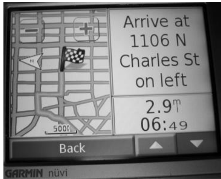
Figure 2 Photograph of Garmin GPS with directions to Brewer's Art.

GPS technology like the device shown in Figure 2 is widely used to determine the most direct route to a destination. Forensic examination of such devices can reveal the location of an individual when a crime was committed.